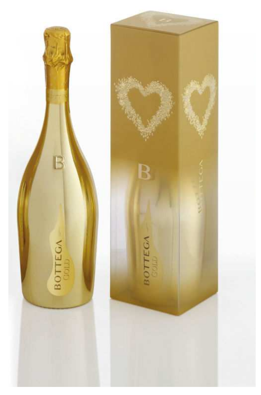
Award-winning Bottega Prosecco DOC Spumante Brut (75cl)

Bottega Gold has been awarded the top medal in the Prosecco Masterscompetition organised by the British magazine The Drinks Business.