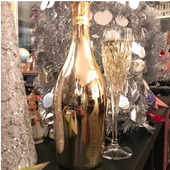
Bottega Venetian Gold Prosecco

We divide our time between our homes in New York City and Southern Spain. We travel the world by air and land visiting wine regions and sail the seven seas teaching wine to luxury cruise guests. So far we have only been to six continents, but we fully intend to be the first journalists to visit Antarctica when they start making ice wine.