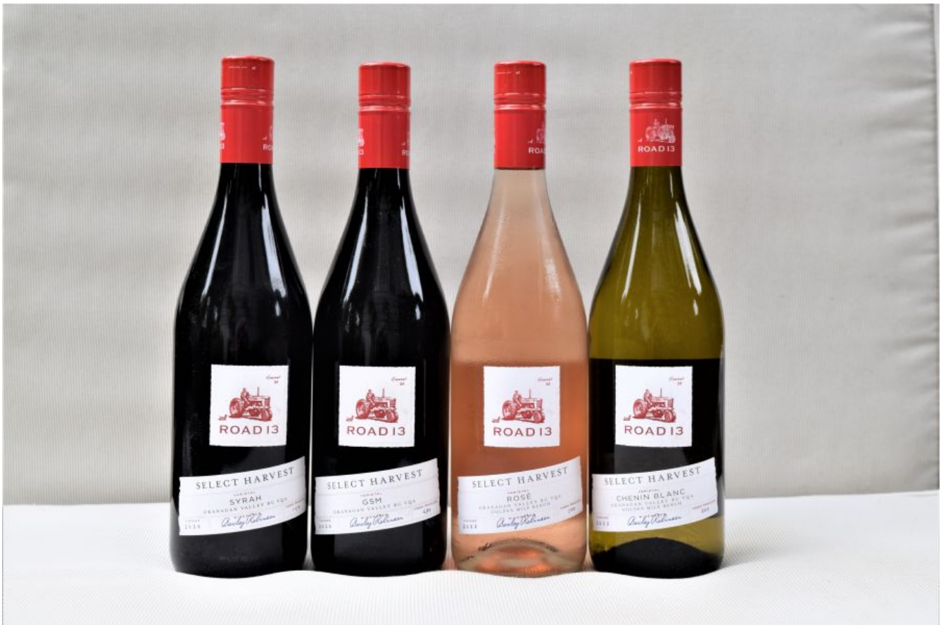
Road 13's Select Harvest portfolio includes, from left, 2020 Syrah ($40), 2020 GSM (Grenache-Syrah-Mourvedre) ($45), 2022 Rose ($28) and 2022 Chenin Blanc ($28).

They are the 2020 Syrah ($40), 2020 GSM ($40) (Grenache-Syrah-Mourvedre), 2022 Rose ($28) and 2022 Chenin Blanc ($28).