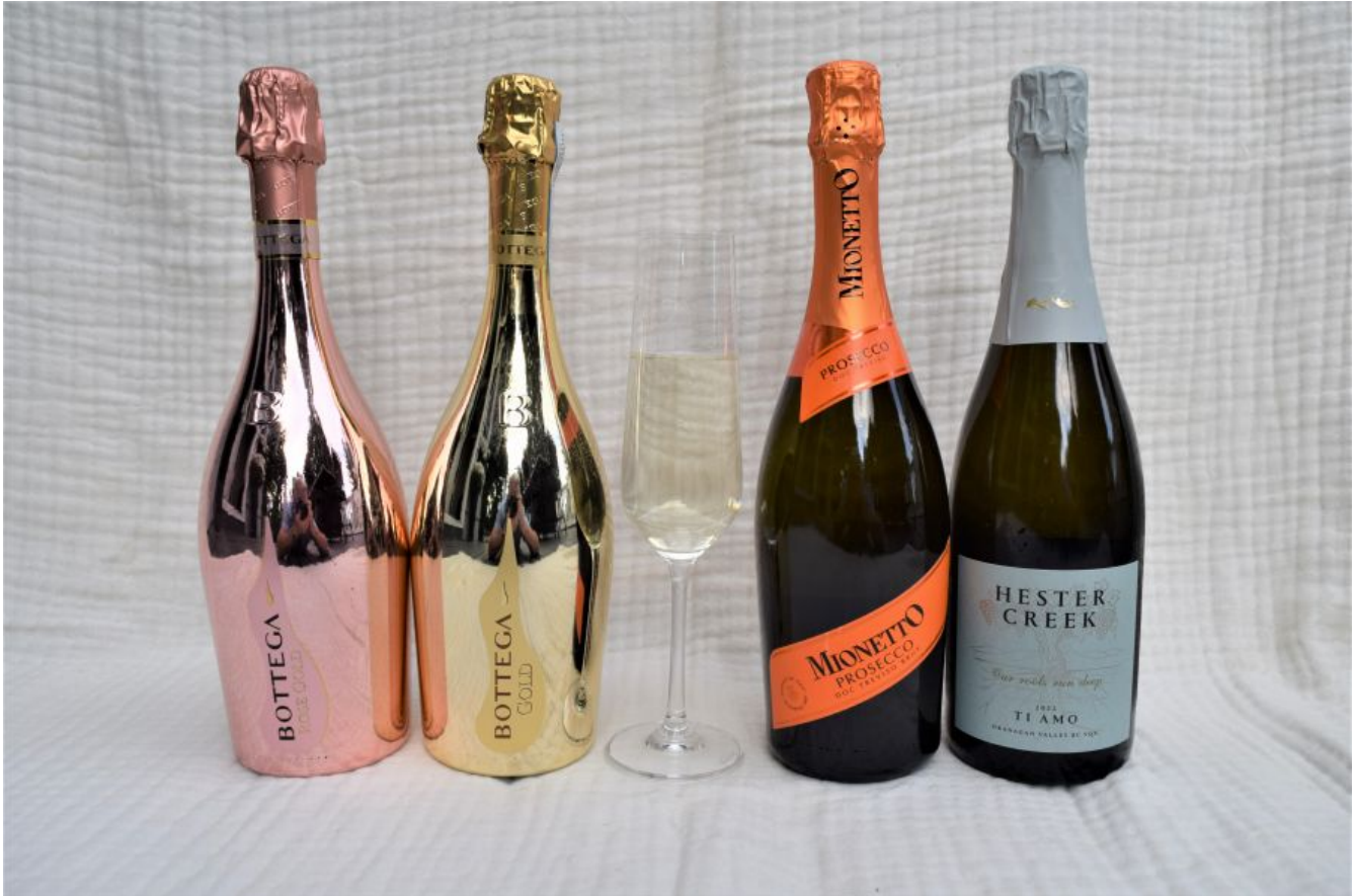
Bottega Rose Gold ($35), Bottega Gold ($35), Mionetto ($19.50) and Hester Creek Ti Amo 2022 ($22).